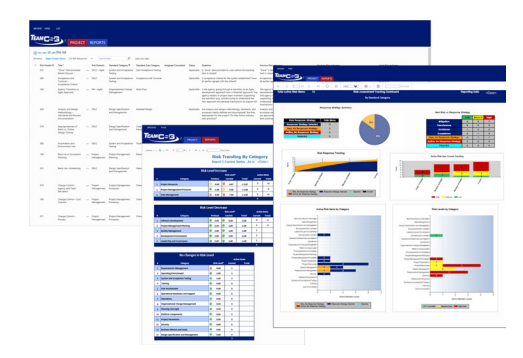
TeamCSG<sup>™</sup> Risk Assessment Tracking and Reporting

Provides the ability to capture and track risks, observations, and recommendations across all assessment efforts and to determine increasing or decreasing risk levels and project health not only at an item level, but also within categories. Provides configurable real-time management reports reflecting the status of all project risks, as well as powerful trending reports for analyzing the ongoing progress and effectiveness of risk response plans.