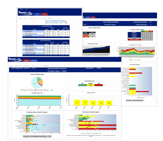
TeamCSG<sup>sM</sup> Project Management and TeamCSG<sup>SM</sup> Operational Readiness

Provides tracking and reporting capabilities for monitoring and assessing readiness for operations and implementation of a system, including powerful dashboard reporting capabilities to support decision-making.